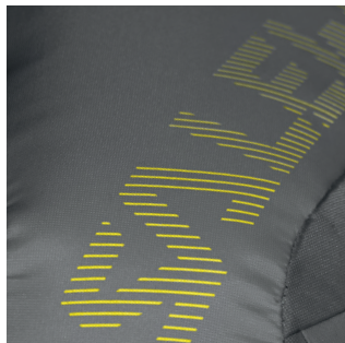
3 REFLECTIVE PRINT

To compress and cinch down the body of the pack, tighten the upper buckle by pulling the strap loop. To compress the lower part, fasten the chest belt, and tighten the two straps.