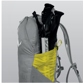
1 POLES SIDE POCKET