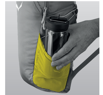
6 COMPATIBLE WITH SALEWA FLASK HOLDER

Slanted mesh side pockets for quick and easy access to important items without having to remove your pack. To stabilize your pack.