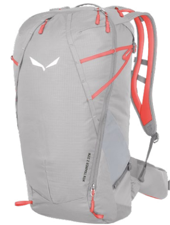
MTN TRAINER 2 22 W

Congratulations on your purchase of a Salewa backpack. We want to be sure that you understand and utilize it in the best way. On the following pages you will find a description of all functions the backpack is offering.