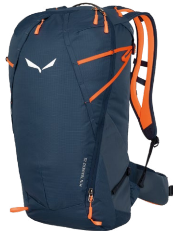
MTN TRAINER 2 25