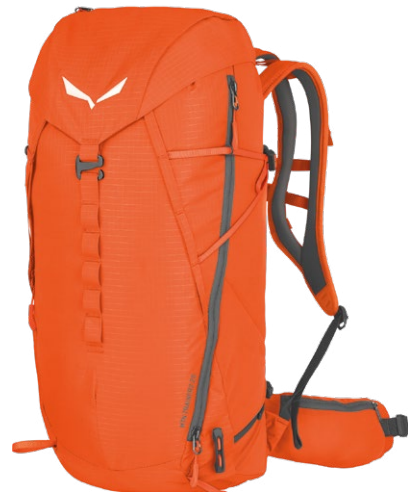
MTN TRAINER 2 28